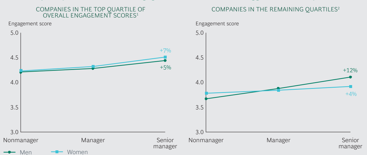
EXHIBIT 1 Companies with Lower Engagement Scores Have the Biggest Gender Gap

Sources: BCG Engaging for Results (EFR) surveys, 2005-2015; BCG analysis.