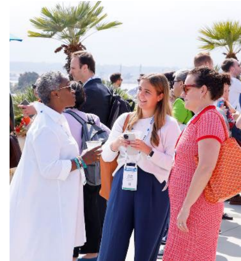
Closing Happy Hour