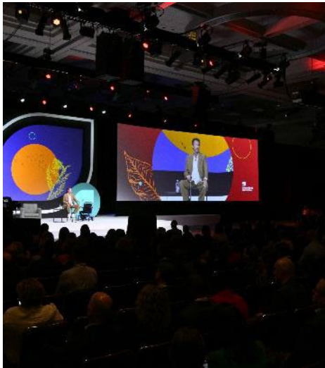
Storytelling Stage, Main Stage Programming, and Sessions