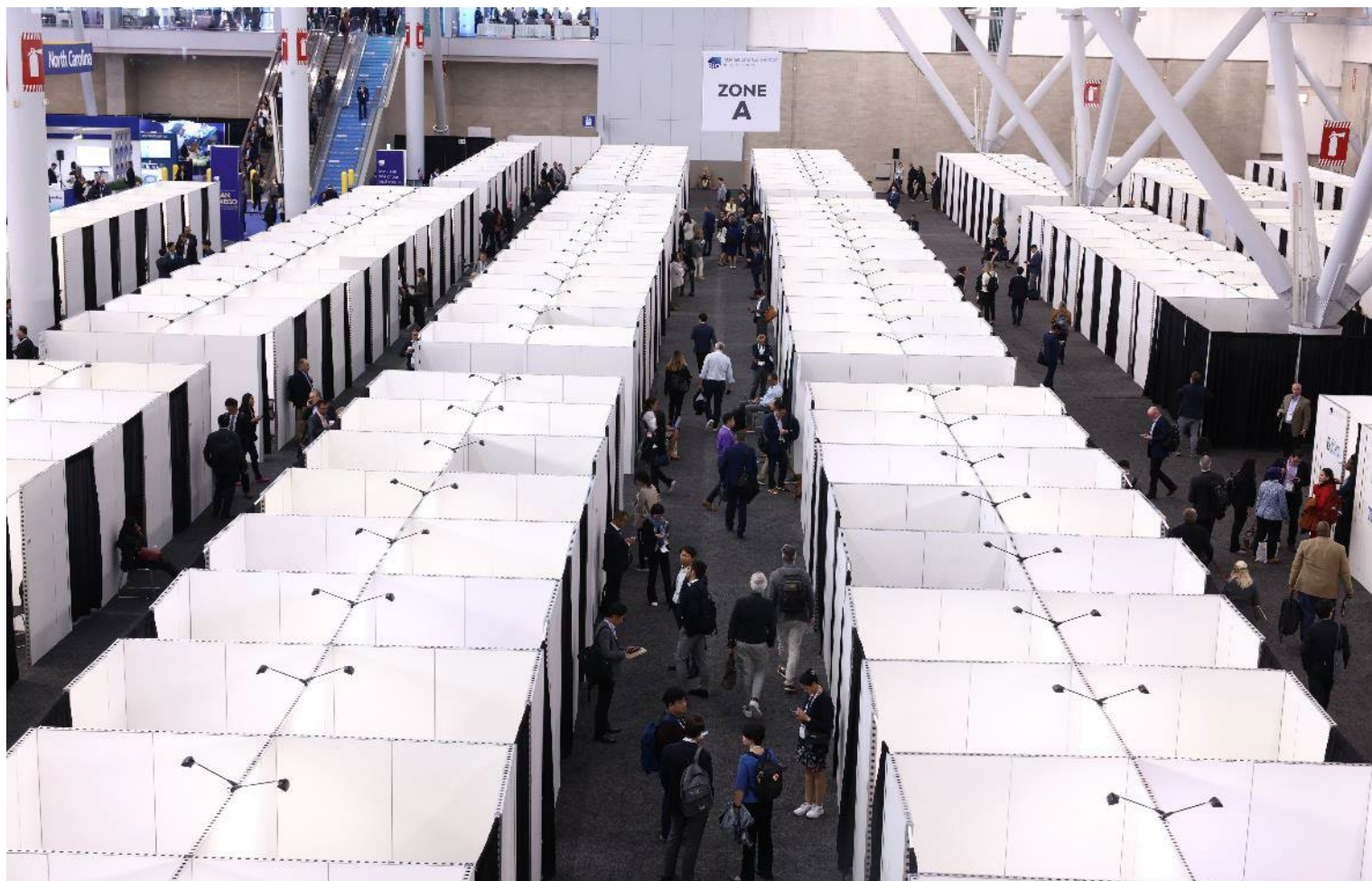
Business Forum Rooms/Suites