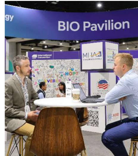
Patient Advocacy Pavilion