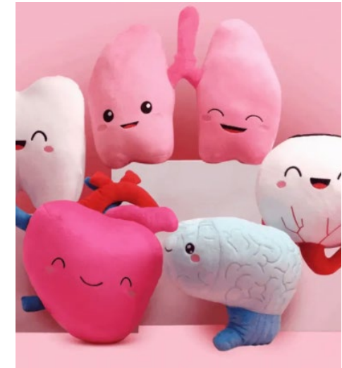
BIO Gives Back: Plushie donations to Boston Children's Hospital