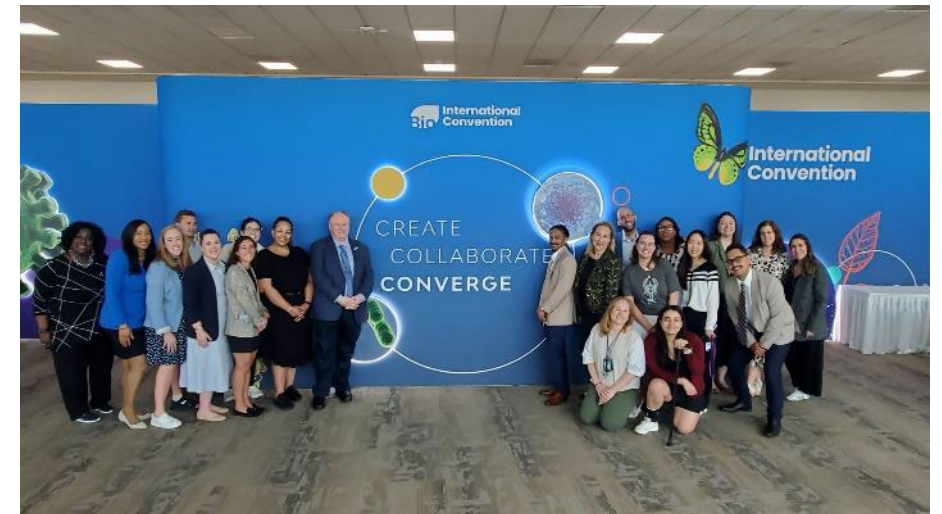
Some BIO Staff at BIO 2024 in San Diego

... with a mission to speak up for the millions of families around the world who depend on biotechnology