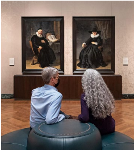
Welcome Reception Boston Museum of Fine Arts